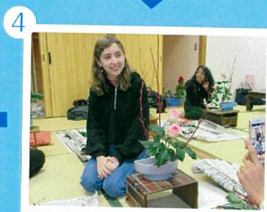
4 'Rising form' arrangements completed.