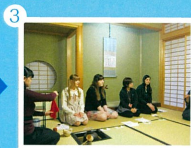
3 The teacher explains as the club leader performs the tea ceremony.