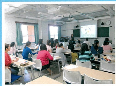
Thai language class

There are about 240 international students enrolled at Ochanomizu University. Foreign language classes taught by native speakers have been held at the Center for International Education in the first and second halves of the academic year since 2002 with the aims of (1) fostering international human resources, (2) promoting exchange between international students and Japanese people, and (3) providing opportunities for international students to contribute to Japanese society. At these classes held during the lunch break, students learn pronunciation, greetings, and simple everyday conversation. For the participants, they provide opportunities not only to study foreign languages, but also to deepen their understanding of different languages, cultures, ways of thinking and values. For the international students serving as teachers, these classes provide them with a valuable experience in Japan. In the academic year of 2018, Thai language class was held in the first half and an Polish class in the second half.