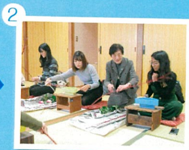
2 Let's start to arrange flowers with the instructor.