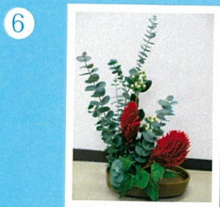
6 The teacher puts theory into practice at the end.