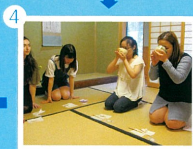
4 Enjoying tea with manners.