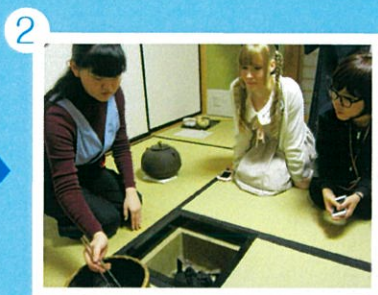
2 A rare opportunity to see hidden aspects of the tea.