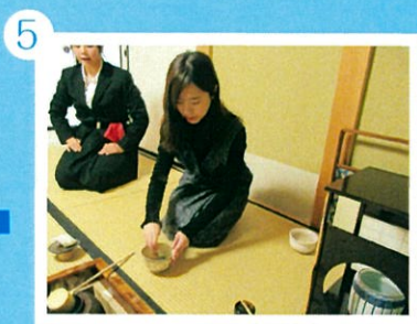
5 Making tea by themselves.