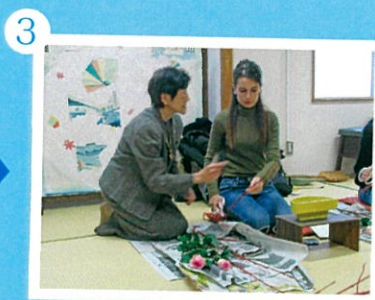
3 The instructor helps students to arrange flowers.