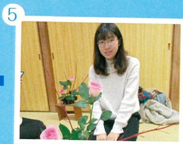
5 Students also tried the 'inclining form'.