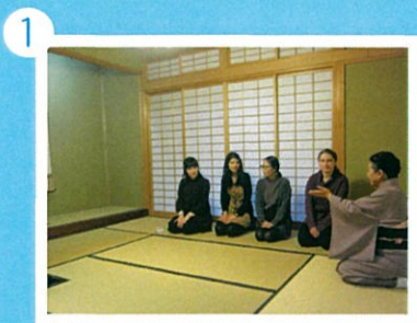
1 The instructor gives an explanation about Kakejiku and Ikebana .