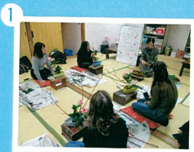
1 The instructor gives a brief explanation about ikebana.