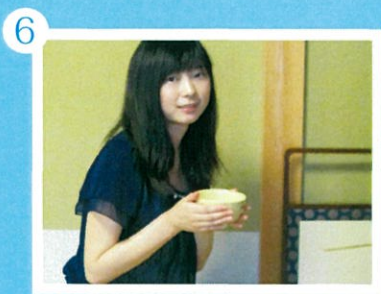
6 All satisfied with delicious tea.