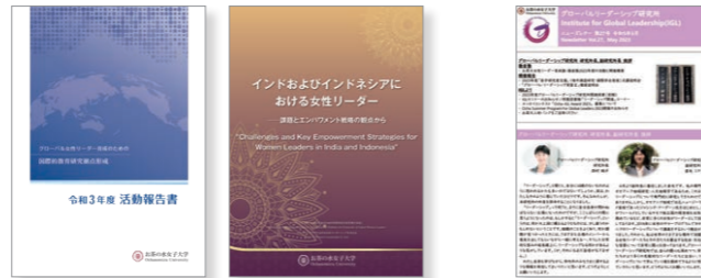
Activity reports, international symposium reports, and others Newsletters